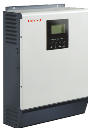
HY1012P / HY5032PN