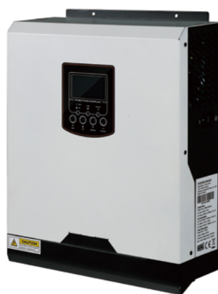
HY3022PN / HY5032VP / HY5032VPN